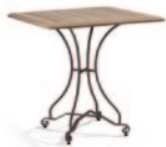
SQUARE BISTRO TABLE LEGS ø2

ALL DIMENSIONS ARE IN CM WITH TABLETOPS INCLUDED FRAMES NOT SOLD SEPERATELY