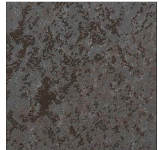
.805 Oxide (ceramic)