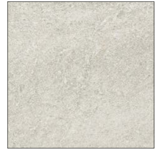
.806 Frost (ceramic)